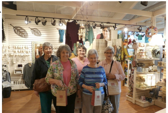
The Needlers visiting Ten Thousand Villages located in Montreat, NC.

Time was spent sitting on the front porch of the cabin crocheting or knitting away and talk, talk, talking! In fact, after our first night sitting on the porch, one of the neighbors stopped us the next morning, as we were going out to explore, telling us that he had noticed "we were just having too much fun to be legal". We are already planning a trip next year and invite you to come and join us. When we began, I knew nothing about the needle crafts, but with much patience the more experienced in our group are bringing me along and you can learn too.