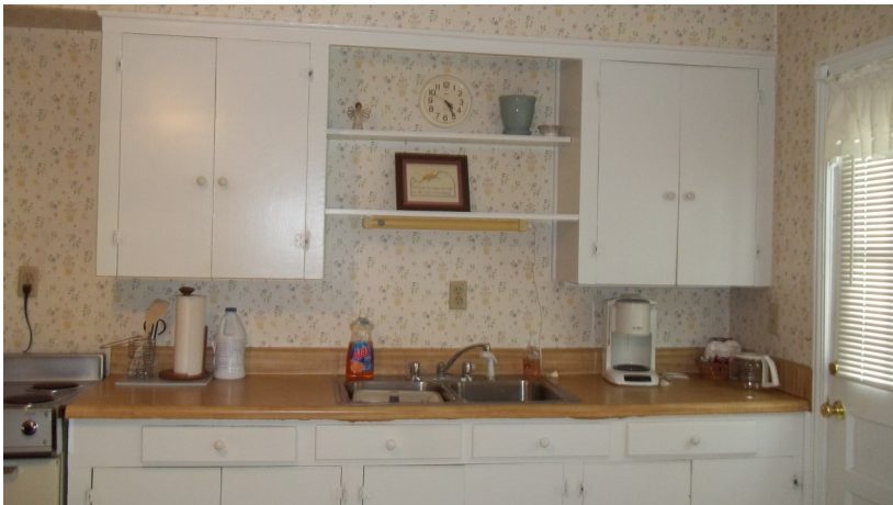
A before and after of a kitchen. More information can be found on page 6.

There is no way to ever Thank the Home Depot Foundation nor their employees for the amount of work that was done for us. However, if you can visit their stores when in need of items, I am sure they would appreciate it even though they never ask for return favors. The employees who actually did the work took either vacation days or took their days off to work on this project. Home Depot's mission is to help our Veterans who have served our country and fought for our freedom.